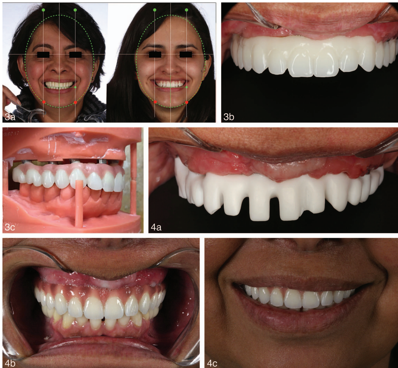
FIGURES 3 AND 4. FIGURE 3. (a) The patient selected the dental arch shape and smile of her daughter as a base for her full-arch implant-supported prosthesis. The facial analysis of digital smile design methodology can be then used to confirm whether patients and relatives have similar esthetic characteristics. (b) Provisional polymethyl methacrylate (PMMA) fabricated from the digital design of the teeth adjusted to the main patient's esthetics. (c) PMMA prosthesis screwed in the implant analogues of the 3-dimensionally-printed casts to check occlusion and make occlusal adjustments. FIGURE 4. (a) Considering the final standard tessellation language file, a compatible zirconia framework was digitally designed and milled. (b) Final maxillary prosthesis with layered application of gingival and tooth-colored ceramic over the zirconia framework. (c) Patient's final natural smile.

The present findings are in agreement with a previous study on digital workflow for full-arch implant rehabilitation using a similar methodology for digital prosthetic planning. 7